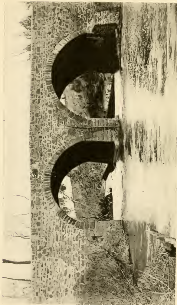
The historic Stone Bridge, near the proposed Park, yet stands. Across it the Lee Highway leads toward the inspiring Blue Ridge Mountains in the distance. This bridge spans Bull Run, a small stream, the banks of which are so precipitous that the crossing of an army in battle line is very difficult. Northern writers generally speak of the battles as those of Bull Run; and Southern writers most generally speak of them as those of Manassas.